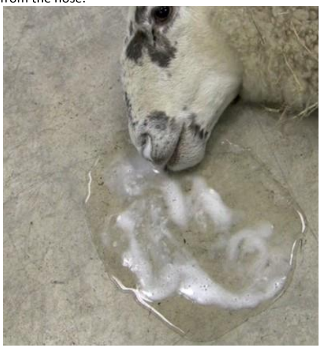
(Typical OPA nasal discharge.)

Ovine pulmonary adenocarcinoma (OPA), also known as Jaagsiekte is a viral disease of sheep resulting in growth of tumours in the lungs. It is a chronic condition, with animals often not showing clinical signs until the end stages of its progression and so older animals are more likely to be seen to be affected. The major sign is long term wasting, with animals consistently losing body condition, though difficulty breathing and a clear nasal discharge may also be visible. In affected flocks OPA can be responsible for anywhere between 1% and 20% mortality per year in adults, as well as having an adverse impact on fertility. One test used to diagnose OPA is the "wheelbarrow" test, where an animal is held up by its back legs to see if the fluid will drain from the nose.